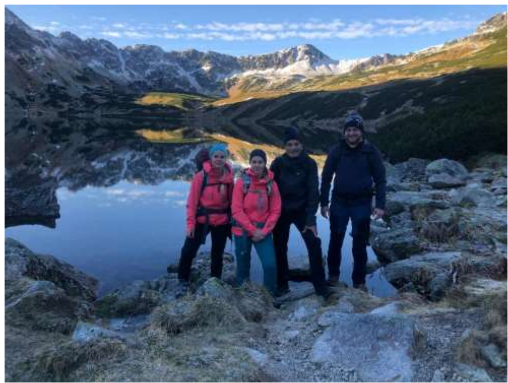
cold morning, 2 weeks ago - my roommates from room #9, here we are parting, there are going to Kozi Wierch I am going to Zawrat