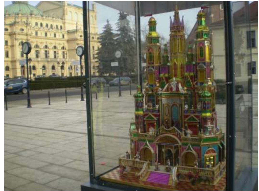
szopka na pl. św. Ducha, w ciągu tygodnia brak turystów, ulice puste tylko czasem tubylcy z lewej teatr im. Juliusza Słowackiego