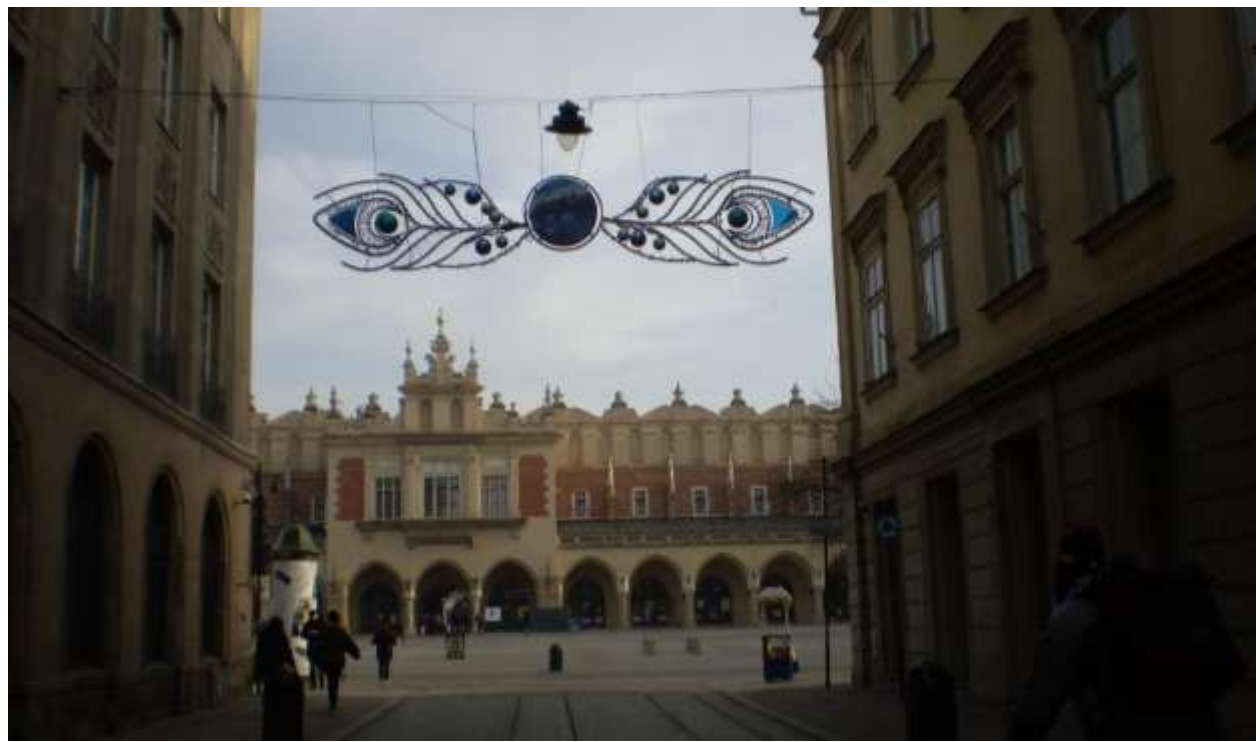
Każda ulica udekorowana pawimi piórami ze zdjęciami zabytków jako zwornik – tu widok na Sukiennice od strony ul. Szewskiej